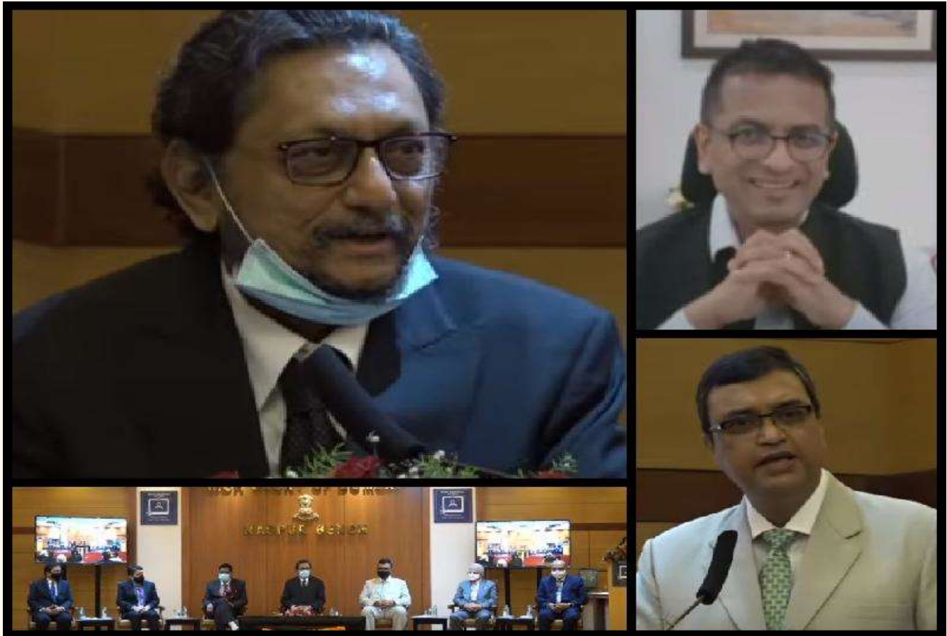
e-Resource Center "Nyay Kaushal" at Nagpur, Maharashtra

On 30 October 2020, India's first e-Resource Center was inaugurated at Nagpur in Maharashtra by the Chief Justice of India Shri Arvind Bobde, in the virtual presence of the Chairman, e-Committee, Supreme Court of India