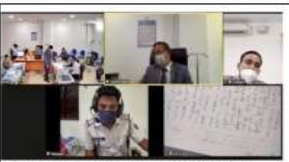
Figure 5: Marking of document using document Visualizer