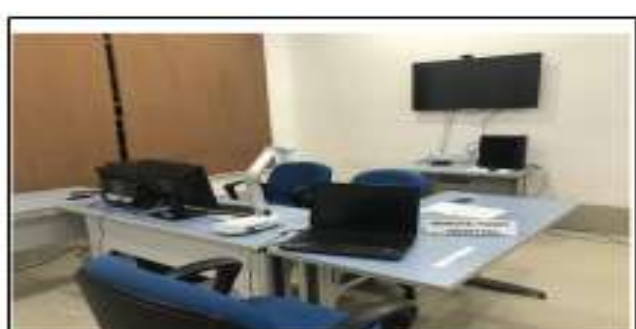
Figure 6: Remote point with VC equipment & Document visualizer