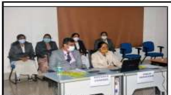
Figure 3: public prosecutor remote point