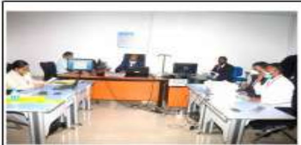
Figure 1: Court Point