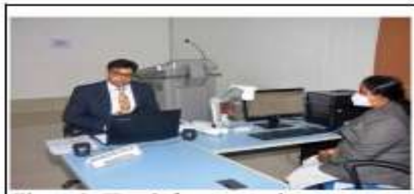
Figure 2: Hospital remote point