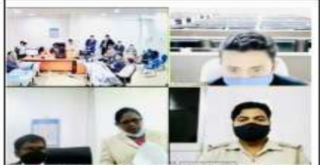
Figure 4: Examination of Police witness