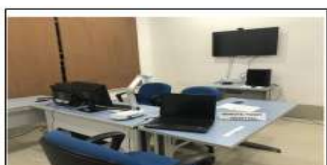
Figure 6: Remote point with VC equipment & Document visualizer