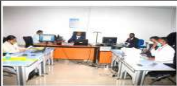
Figure 1: Court Point